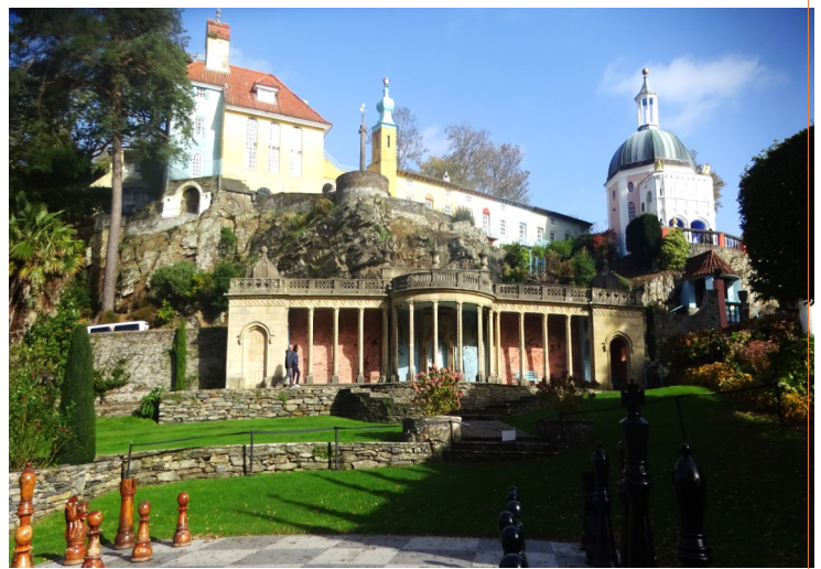
Left - Walkers enjoy the good weather. Right - View of Portmeirion. Top - Bust of Patrick McGoochan